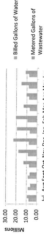
Billed Gallons of Water vs Metered Gallons of Wastewater

Average Monthly Use 4,433 Gallons 2079 customers