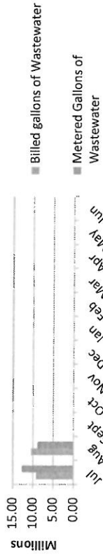
Billed Gallons of Water vs Metered Gallons of Wastewater

Average Monthly Use 4,854 Gallons 2147 customers